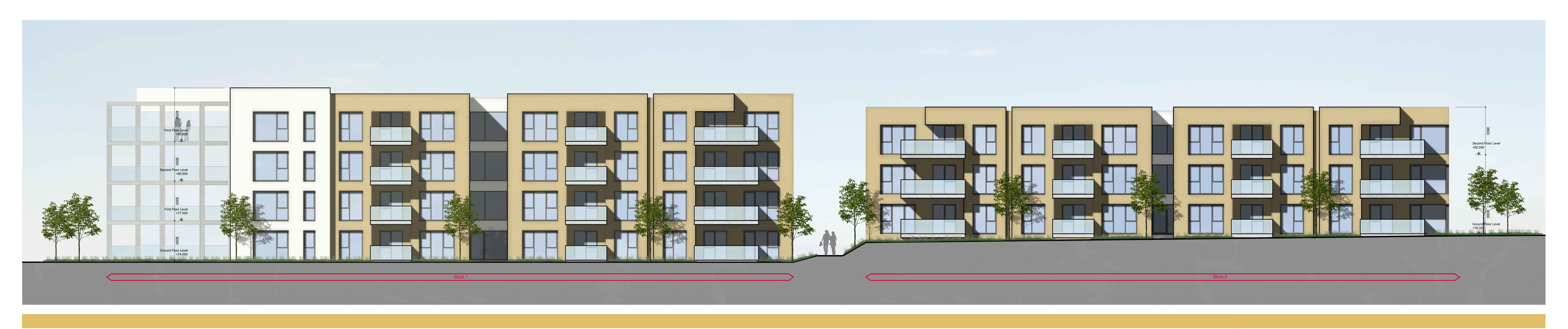
CHARACTER AREA 3- - Selected buff/ white brick and stone details