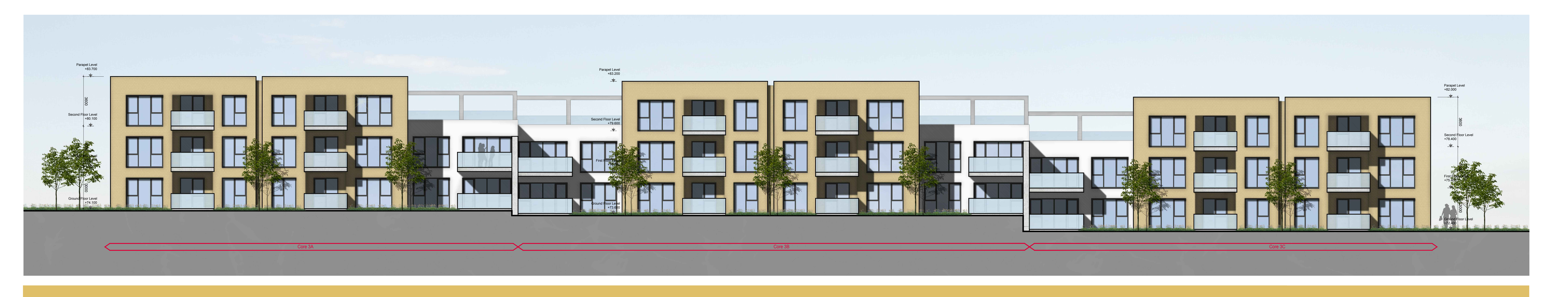
CHARACTER AREA 3- - Selected buff/ white brick and stone details